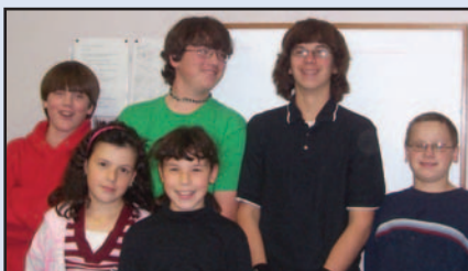
Six Arizona young people receive God and Church Awards.

Six Arizona middle school youth received God and Church Awards. They